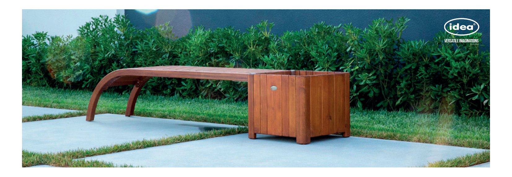
DIMENSIONS: L2300xW450xH440 mm